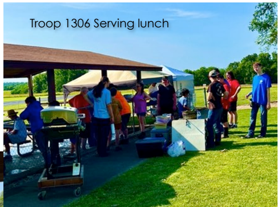
Troop 1306 Serving lunch