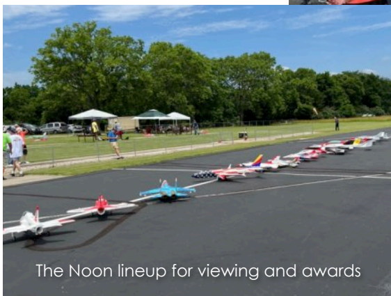
The Noon lineup for viewing and awards