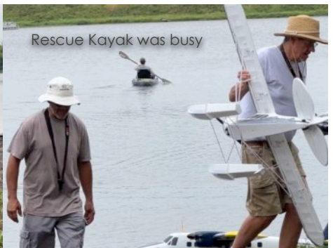
Rescue Kayak was busy