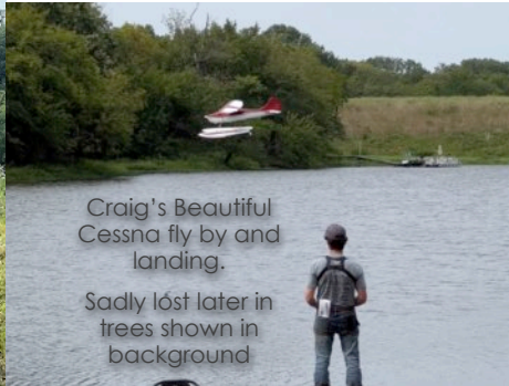
Craig's Beautiful Cessna fly by and landing. Sadly lost later in trees shown in background