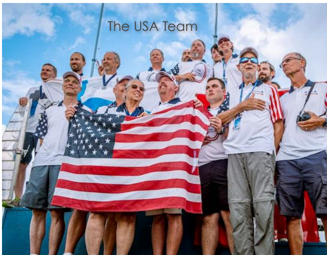
The USA Team