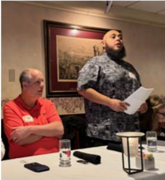
President Chavez officiates