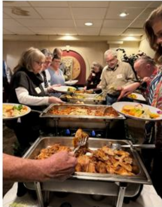
Dinner is SERVED!!!!